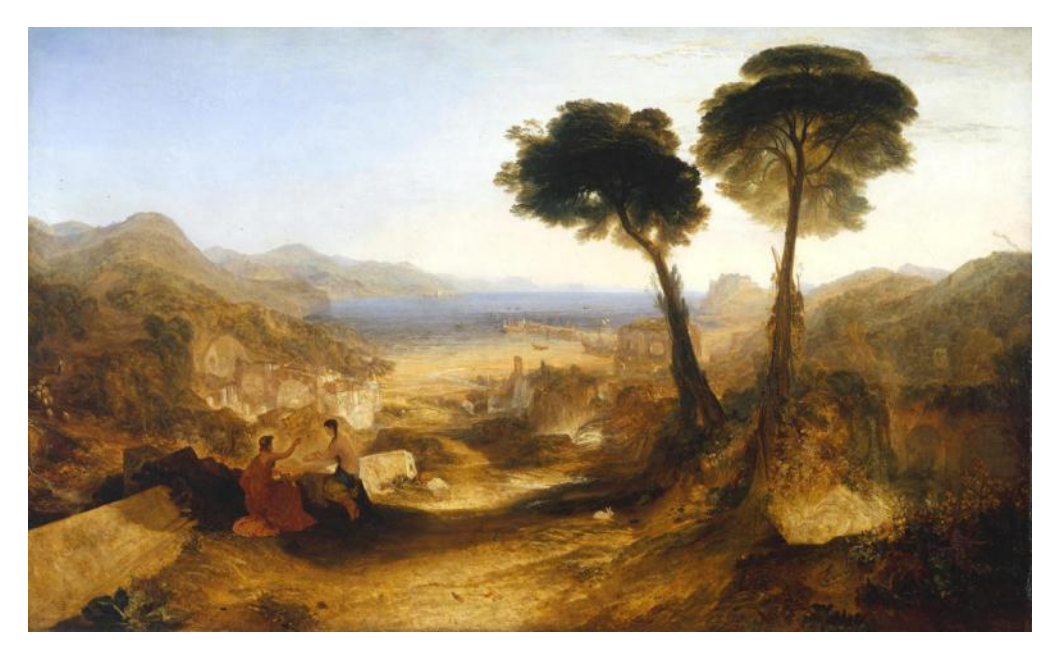
Figure 1 Joseph William Mallord Turner, The Bay of Baiae, with Apollo and the Sibyl, exh.1823. Oil on Canvas, 145.4 cm x 237.5 cm. London: Tate.

Our Exhibition at the Royal Academy is the very worst I have seen for many years and Turner has an outrageous landscape with all the colours of the Rainbow in it [fig. 3]. Lawrence has several but gaudy, careless and unfinished (...)^3