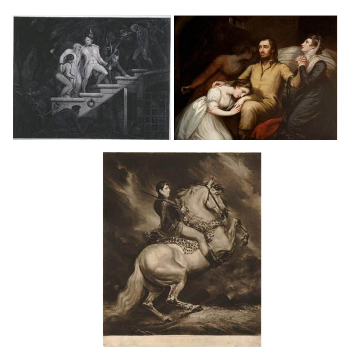
Figure 6 James Gillray, after James Northcote, Le triomphe de la Liberté en l'élargissement de la Bastille, dédié à la Nation Francoise , 1790. Etching and Engraving. London: British Museum.

Figure 7 James Northcote, Lafayette in the Dungeon at Olmutz , 1797. Oil on Canvas. Manchester: Manchester University, Tabley House Collection.