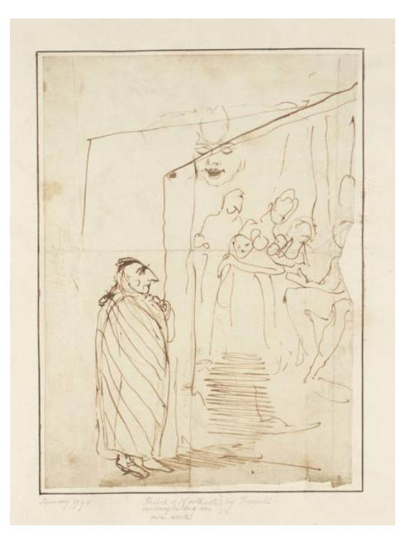
Figure 4 Henry Fuseli, Caricature of James Northcote, c. 1820. Ink on paper. London: Tate.

Richard III type of Fuseli's [fig. 4]; a hypocrite, liar, and poisonous and the merciless exploiter of his brilliant young friend and interlocutor.<sup>8</sup>