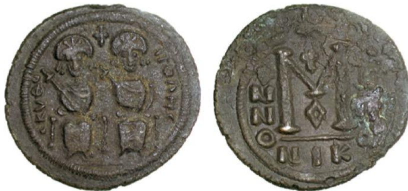
Figure 6 This follis , minted in Skythopolis in the mid-seventh century, displays a range of features imitating Byzantine prototypes, but the die cutter also made distinctive and local choices about the information presented. (Barber Institute Collection, A-B01, used with kind permission of the Barber Institute.)

value of the coin, of 40 nummi though it is impossible to tell what these local issues might have been worth or how this may have been calculated or enforced. NIK was the mint mark of the city of Nikomedeia, which had produced coins of this design in the late sixth century, probably including the prototype for this example. Thus, a range of different texts are displayed on this coin, some with conflicting meanings. Their relevance depends on the register in which they are read: NIK conveyed the familiarity of the type and therefore its reliability and usability, just like the choice of an out-dated but recognisable and traditional type, but it no longer carried any geographical meaning. 'Skythopolis' communicated its local origin and perhaps something about the authority which issued it.