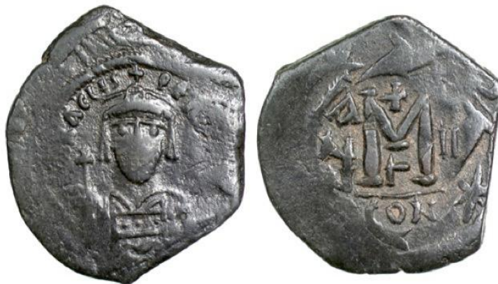
Figure 11 At times of crisis, copper coinage in particular demonstrates few of the qualities associated with fine gold coins, being often illegible, poorly designed and inconsistent in execution.