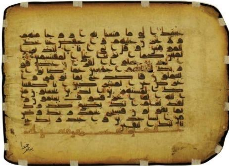
Figure 8 9th-century Qur'an, written in Kufic script on vellum, uses no figural imagery. Its production location is unknown.