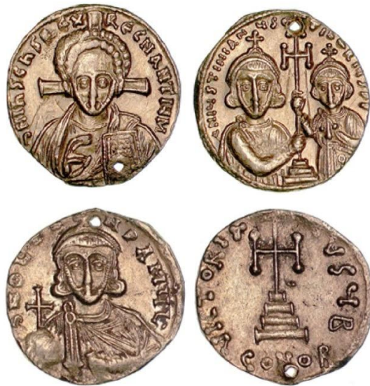
Figure 5 These two solidi of Justinian II (first reign 685-95, second reign 705-11) and Leo III (r. 717-41) demonstrate the different ways in which users might respond to the images on coins, reflected in the position of the piercings in relation to the image of the cross and the portrait.

That Christian imagery on coins did not end up at the centre of written debates (or those that survive), however, does not mean that seventh- and eighth-century coin users were not equally diverse in their responses to it as were the curatorial team or the exhibition's art historical viewer. Though the curators were aware of the visual significance of Christ's portrait on the coinage, and indeed made that the centrepiece of cabinet six, it required the input of a different perspective to observe the inconsistency (from an Orthodox viewpoint) in being aware of this significance and still treating the coin simply as an object to be used as part of a larger design scheme. It is also perhaps significant that in this period Justinian II was the only emperor to display Christ on his coins. Though the image returned in later centuries, his successors immediately discontinued the practice. Use of coins in Late Antiquity, in other words, demonstrates similar inconsistencies and layered considerations to those apparent in the range of modern responses to these coins. These inconsistent responses are, moreover, uncommonly visible on the coinage at a different level to theoretical texts, giving a rare insight into individual behaviour and personal choices beyond the clergy or the literati of the court.