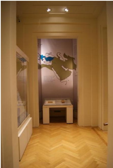
Figure 3 A hanging map of the Umayyad Caliphate (in green) c. 700 was used to help visitors to appreciate the huge change in the geopolitical landscape of the Mediterranean by the rise of Islam.