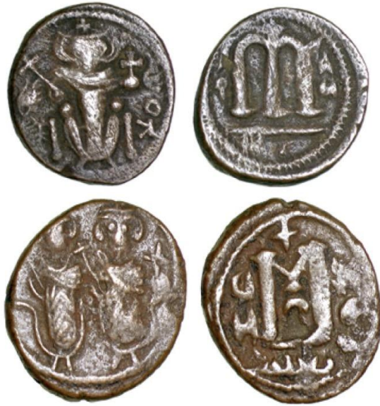
Figure 7 These folles also minted in the mid-seventh century in Damascus and Baalbek likewise represent local uses of widespread imperial prototypes but in these cases and that of the Skythopolis coin previously examined, the choices made are different. (Barber Institute Collection, A-B05 and A-B19, used with kind permission of the Barber Institute.)