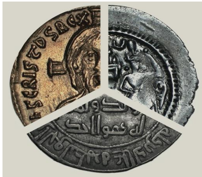
Figure 4 Three coins, used to represent the Byzantine and Sasanian empires and the Umayyad Caliphate, were presented as components of a single composite image at the centre of the display board in cabinet three.

One of the coins chosen (upper left, Fig. 4) was the Byzantine gold solidus of Justinian II, which bears on its obverse, instead of the emperor, the bust of Christ. Upon seeing this for the first time, a colleague with a background in Byzantine art history and theology pointed out that the way in which the coins had been divided entailed cutting the image of Christ, which could be perceived as iconoclastic. Apart from highlighting a possible and overlooked area of offence, which was in no way the aim of the exhibition, in the context of Byzantine coins and the imagery on them, this has particular significance.